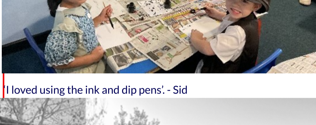
'I loved using the ink and dip pens' - Sid